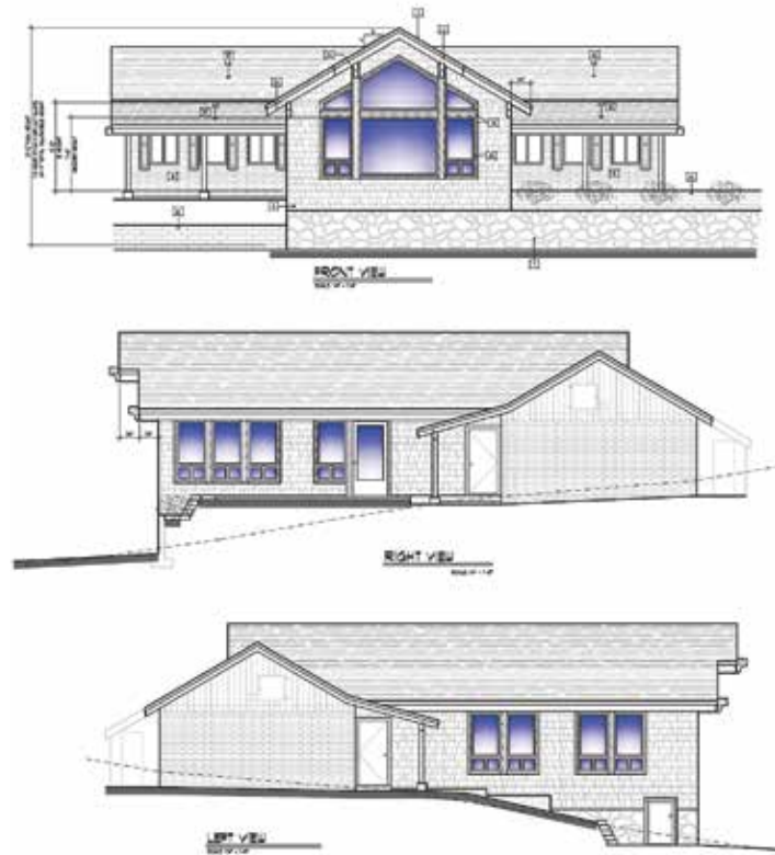
Derby Talbot Lodge drawing by Building Concepts Inc see proposed floor plan on next page